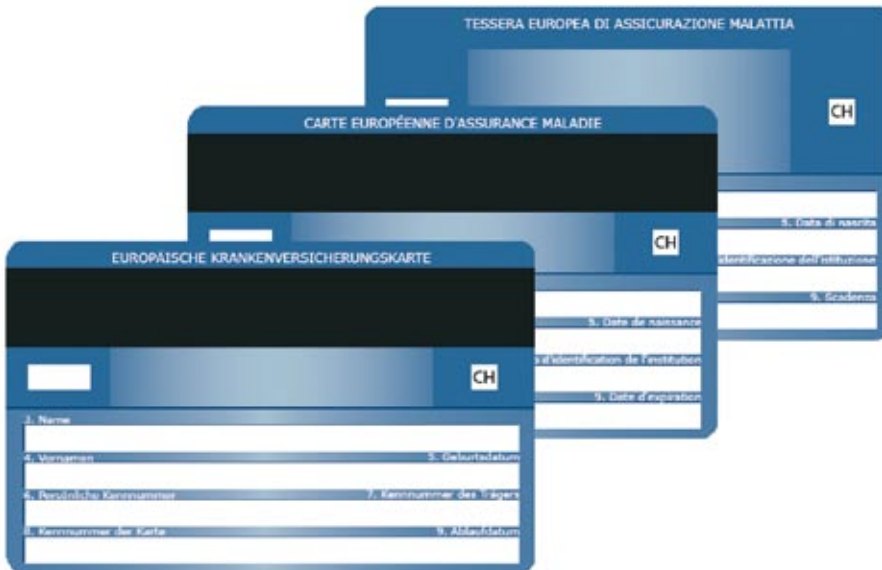
European Health Insurance Card

▶ As a general rule, the costs of outpatient care provided by a doctor or hospital must be paid directly to the care provider. Reimbursement of expenses must be submitted to the liaison body ( www.kvg.org ) or to the appropriate sickness insurer. A flat rate corresponding to the excess and the share of costs is incurred by the individual. The flat rate is CHF 92 for adults and CHF 33 for children over a period of 30 days. The costs of hospital treatment are directly covered by the liaison body; the flat rate may be deducted for a period of 30 days.